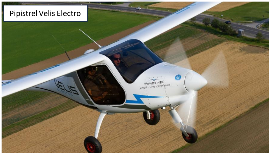
Pipistrel Velis Electro