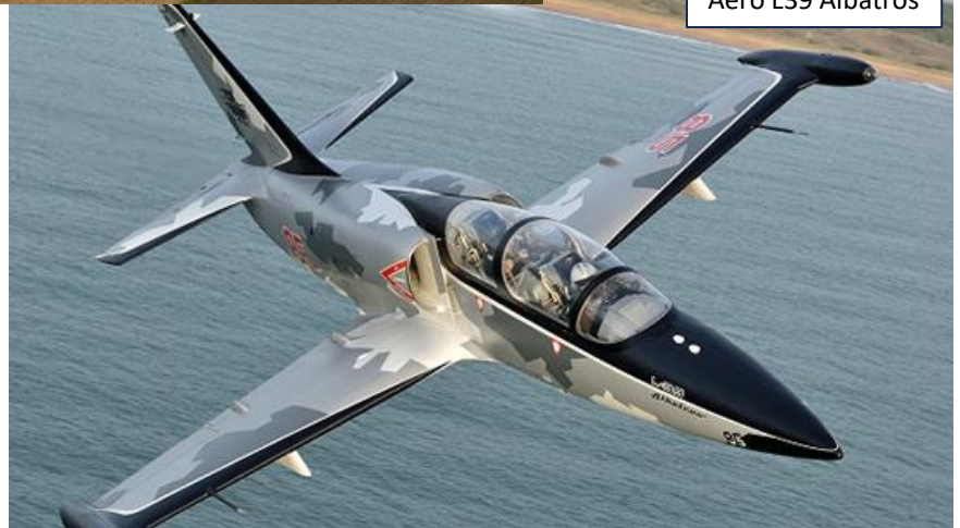
Aero L39 Albatros