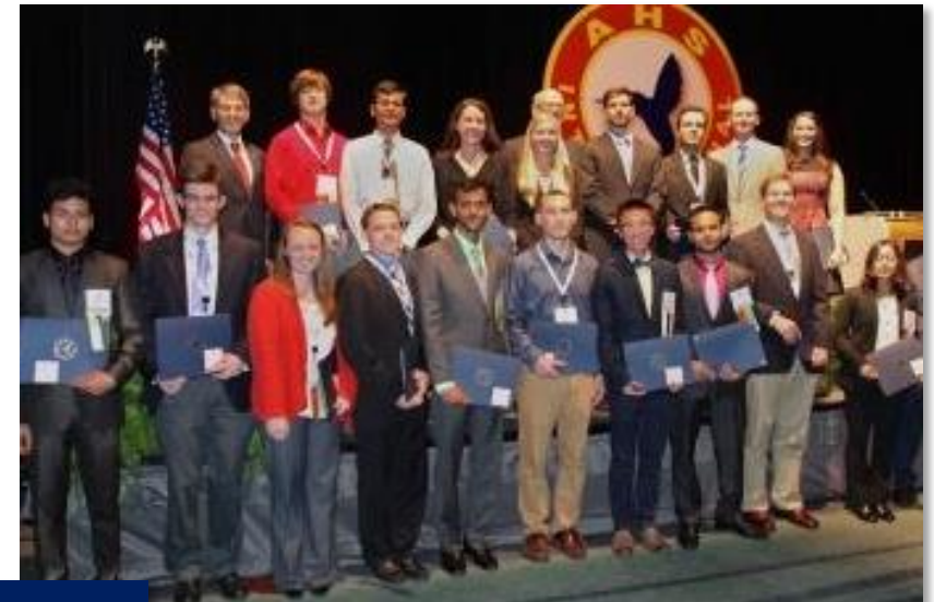
VFF Scholarship Winners at Forum 71, May 2015